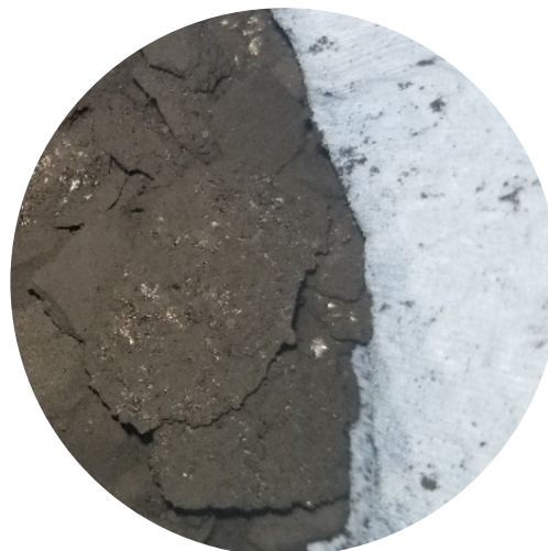
Figure 2: Excessive thermal degradation can lead to hard carbon deposits.

High boilers are degradation byproducts with a higher boiling point than the parent fluid. High boilers are typically formed when low boilers recombine or polymerize into higher molecular weight fragments. Unlike low boilers, high boilers